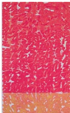
Book of Songs Cheung Chung-chu 2007