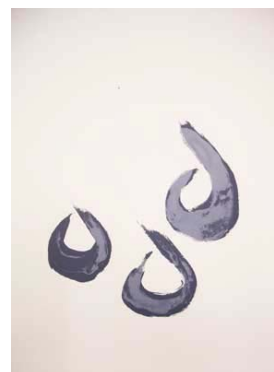
Buns #1 Cybil Chiu 2009

Tutor: Yung Sau-mui Date: 18 April 2009 (Every Sat) Time: 11:00 – 13:00 Tuition: $980.00 (plus $500 Material Fee) Meetings: 8, a total of 16 contact hours Explore all the exciting possibilities of serigraphy: direct stencil methods, inks and modifiers, photo-silkscreen techniques and mono-printing.